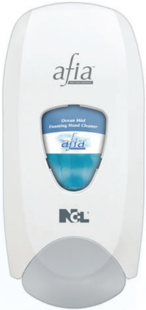
#4216 afia™ Manual White case qty 12