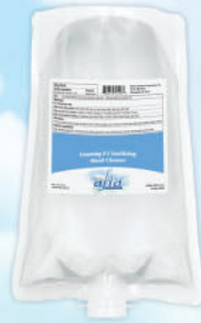
#0448-57 Foaming E2 Sanitizing Hand Cleaner 6 - 1000 mL / case