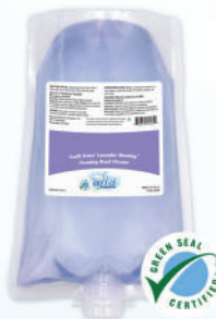
#0434-57 Earth Sense Lavender Morning™ Foaming Hand Cleaner 6 - 1000 mL / case