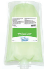
#0436-57 Spring Blossom Premium Foaming Hand Cleaner 6 - 1000 mL / case