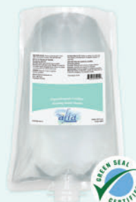
#0444-57 Hypoallergenic Certified Foaming Hand Cleaner ** 6 - 1000 mL / case