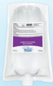
#0445-57 Alcohol - Free Foaming Hand Sanitizer 6 - 1000 mL / case