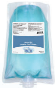
#0431-57 Ocean Mist Foaming Hand Cleaner 6 - 1000 mL / case