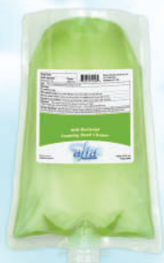
#0446-57 Anti-Bacterial Foaming Hand Cleaner (PCMX) 6 - 1000 mL / case