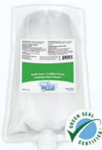
#0433-57 Earth Sense Certified Green Foaming Hand Cleaner 6 - 1000 mL / case