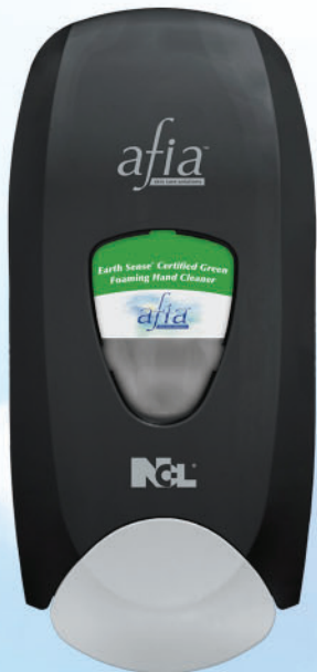
#4217 afia™ Manual Black case qty 12