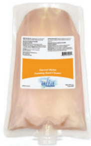
#0430-57 Harvest Melon Foaming Hand Cleaner 6 - 1000 mL / case