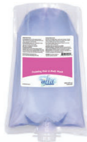
#0435-57 Foaming Hair & Body Wash 6 - 1000 mL / case