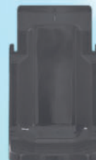
#4222 afia™ Drip Tray Individual