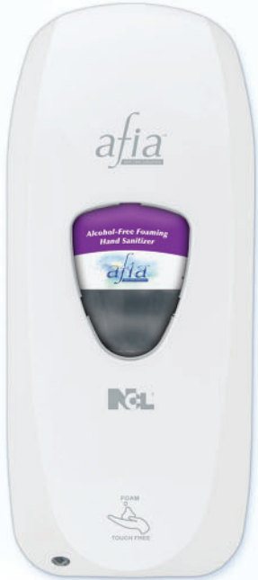
#4223 afia™ Touch Free White case qty 6