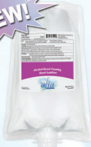
#0440-57 ALCOHOL BASED Foaming Hand Sanitizer 6 - 1000 mL / case