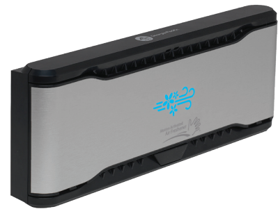
ActiveAire® Automated In-Install Freshener Dispenser