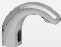
enMotion® Automated Touchless Counter Mount Soap Dispenser

*Ask about our 100% Recyclable bottled soap and sanitizer refills