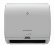
enMotion® Impulse® 8" Paper Towel Dispenser