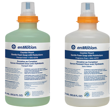
enMotion® Counter Mount Soap Refills