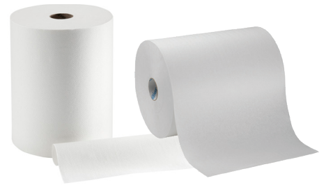
enMotion® Paper Towel Refills