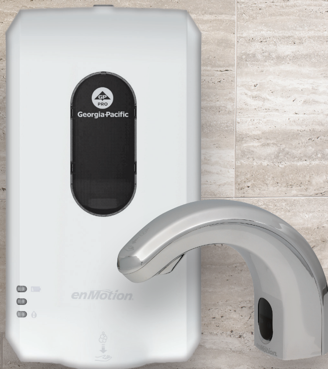
enMotion® Automated Touchless Counter Mount Soap Dispenser