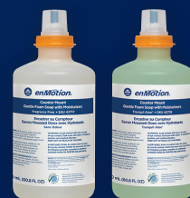
enMotion® Counter Mount Soap Refills