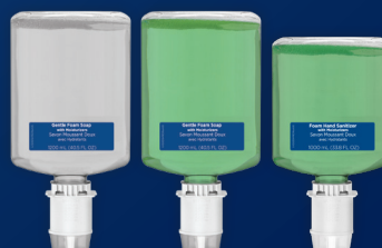
enMotion® Gen2 Soap & Sanitizer Refills

100% recyclable refills contain 25% post consumer content