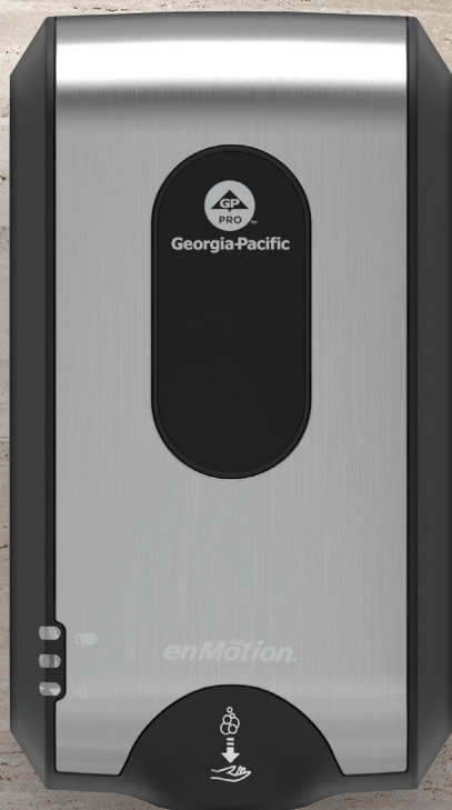
enMotion® Gen2 Automated Touchless Soap & Sanitizer Dispensers